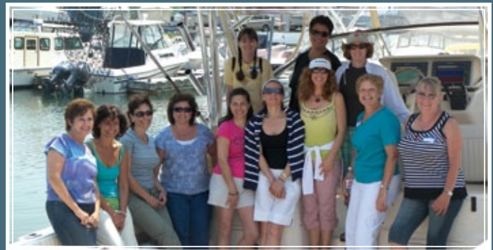
2007 Women Making Waves Seminar

“I remember being the only woman in the exhibit hall during the New York Show in the 1970s and 1980s. Seeing another woman head one of the most popular boat manufactures inspired not just me but others to enjoy boating recreationally and professionally.”