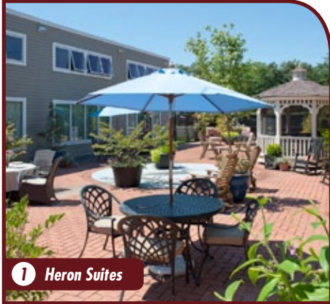
1 Heron Suites

Check-in has moved to the new waterfront lobby. Remember to use your VIP card for 10% discounts on room stays.