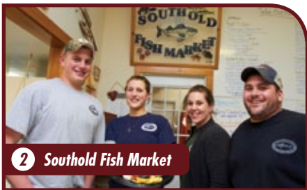
2 Southold Fish Market

Check-in has moved to the new waterfront lobby. Remember to use your VIP card for 10% discounts on room stays.