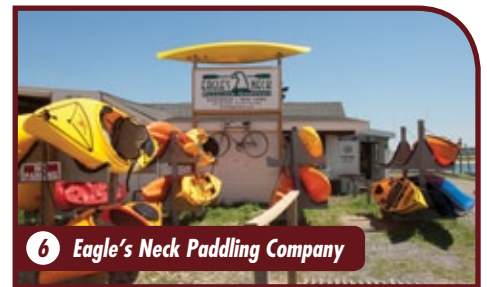
6 Eagle's Neck Paddling Company