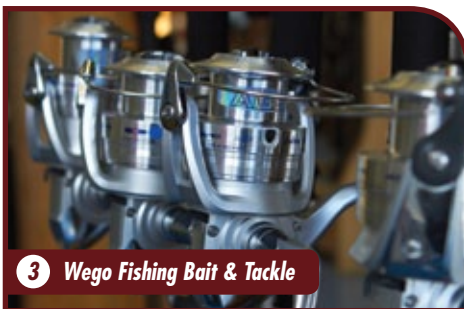
3 Wego Fishing Bait & Tackle

Adjacent to the Heron Suites lobby you will still find Charlie Manwaring's Southold Fish Market . Over the years, Charlie has expanded the offerings of the fish market to include a wide variety of take out salads, wraps, and sandwiches in addition to typical seafood. Outside the Southold Fish Market are waterfront tables and chairs, which allow guests to sit down and enjoy their meals in a picturesque setting.